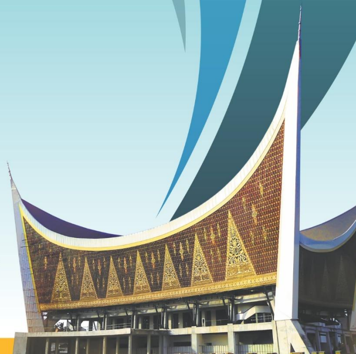
Mosque Of West Sumatera